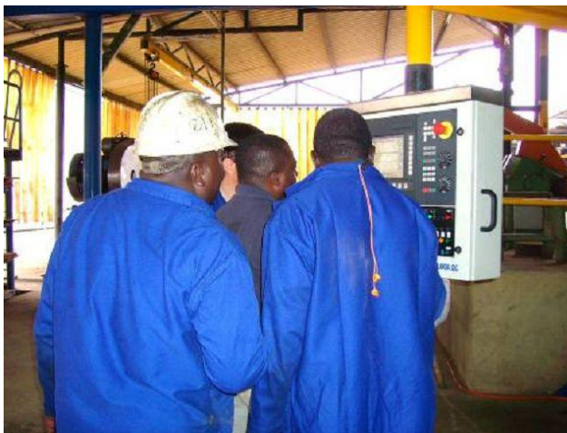
Figure 15: As the machines 24 hours / day / 7 run day week, it takes many Operators.