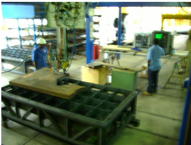
Figure 6: 3000 x 4000 and 2000 mm stroke / Flat / movement. Here can be made what needs to be done. The flame cutting Machine has almost no limits.