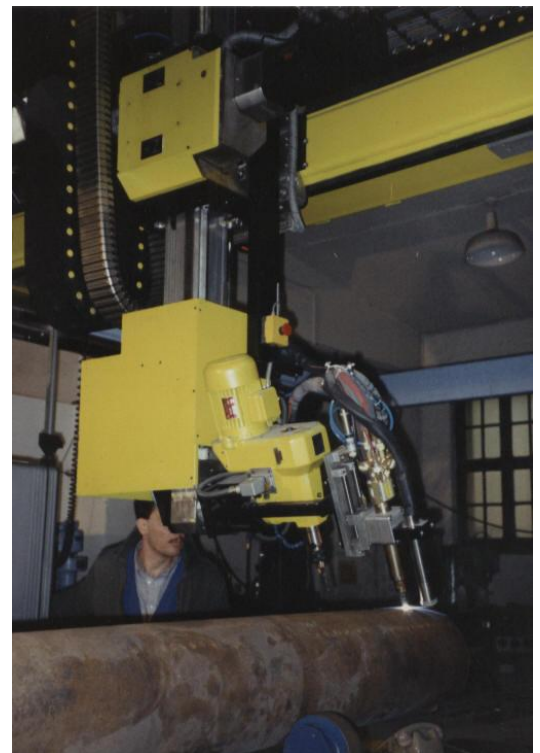
Figure 18: The cutting head can be in all Directions turn.