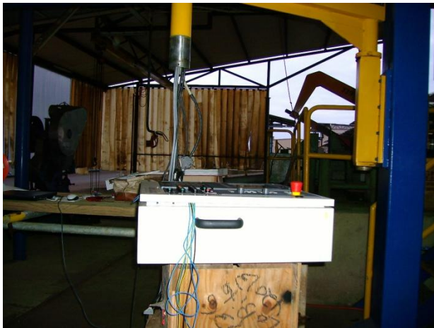
Figure 5: the panel is attached to the same place, where the old, already 20 years CNC control, was.