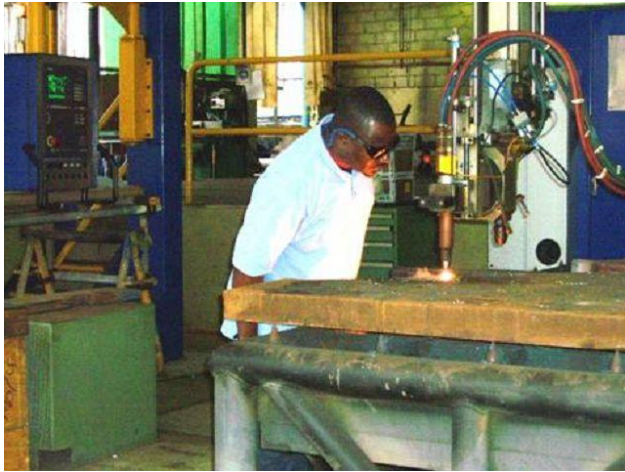
14: Now the machine does everything automatically. The programming for the Preheat and with the various valves Beginning a few hours of work, because the whole process needs a little experience.