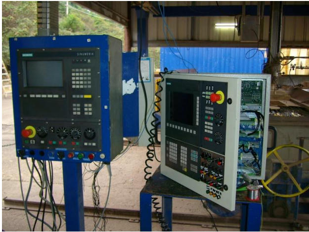
Figure 4: Here the old CNC is against the new replaced. For the old CNC there was the spare parts no longer guaranteed.