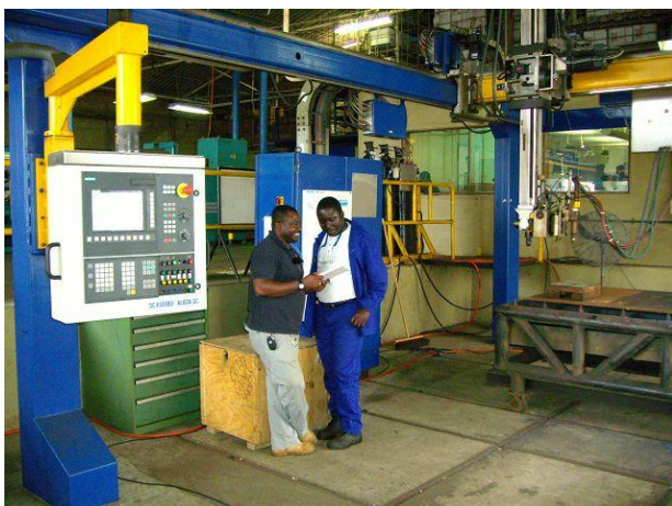
Figure 16: surgeons in discussing.