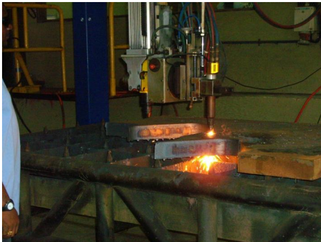
Figure 1: Up to 200 mm thick plates can with of the plant to be cut.

The flame cutting machine WIAP FPL machine was built in 1993, made of a gantry of the company WMW, bought at Sulzer. In September 2006, converted to a new one CNC Sinumerik 802 of Caroline and HP Widmer in Angola. 7 machines, all the same CNC control, which is ideal for the maintenance.