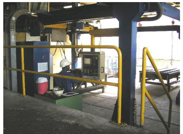
Figure 9: Top surgeons. After sketches they have delivered a part in 15 minutes.