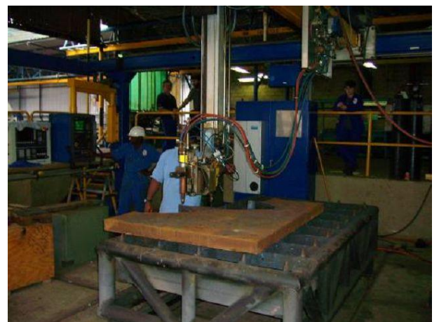
Figure 13: Here is a section through a via prepared 100 mm-thick steel plate.