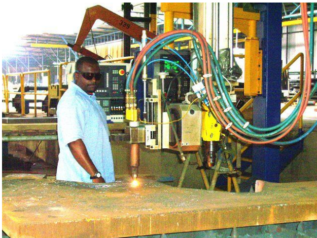
Figure 11: surgeon observes the Melo Cutting process. Used to be a pre-drilling Necessary, but a special cycle has Piercing without pre-drilling permits.