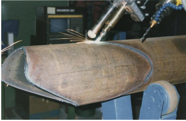
Figure 19: plasma or oxyfuel, both were integrated.