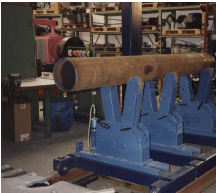
Figure 20: Here, the pipe support. It was planned to cut pipes with the plant saddles to 12 meters.

The WIAP AG continues to expand its machine tools and has a subcontractor base. Whether for new machines or conversions; there are usually used everywhere the same internal components. Thus, the spare parts warranty is secured.