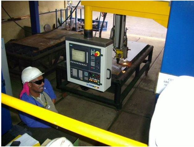
Figure 10: Thanks to the many cycles was much be easily executed.