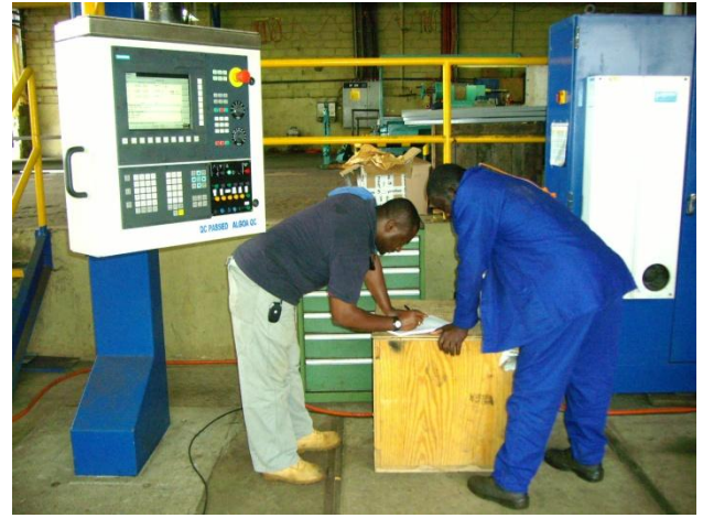
Figure 7: The operators are very clever. In front Place on hand sketches, they make the Preparation, is then programmed.