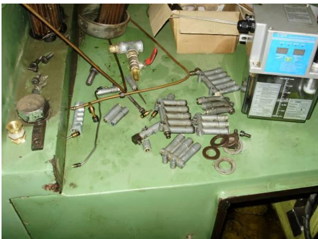
Figure 38: The cultivation of an automatic lubrication. The lubrication pump we have once again renewed with pressure switches and level switches, so that pressure line faults are detected at the control.