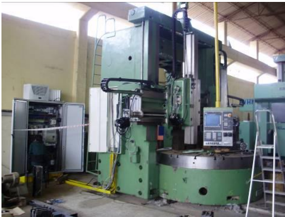
Figure 27: The machine is taking shape. Soon all new cables are pulled. 2 axes are already running. We now travel back after 20 days and come back in about 2 weeks from mid-November, because we still need to test turning yes and schools.