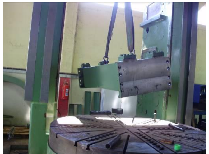
Figure 8: The side stabilizer below.