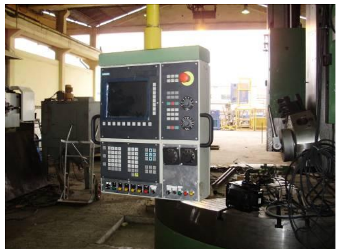
Figure 25: Specification of CNC supplements. finish cabinet and test.