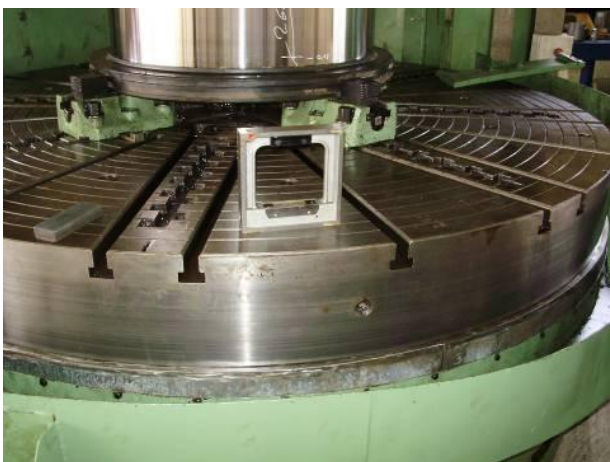
Figure 45: measuring with the frame level on the face plate.