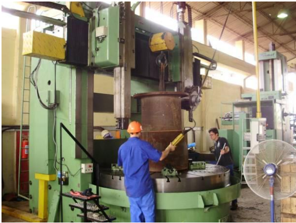
Figure 54: Now a large workpiece is placed on the face plate.