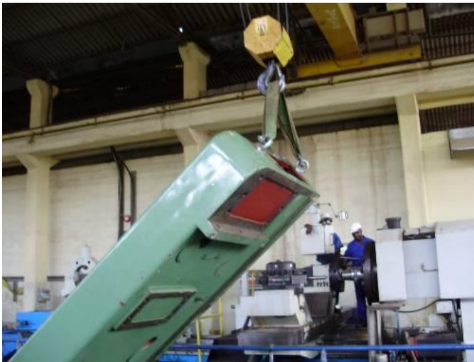
Figure 5: Setting up phase second