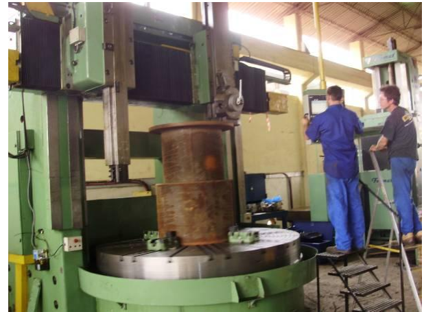
Figure 57: The machine just before the handover to production.