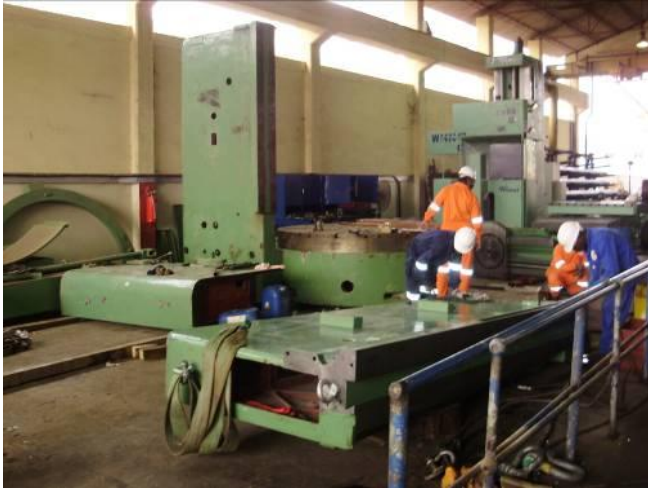
Figure 4: The guides are deducted before assembly, so that no damage caused by violations of the land done.

stand is 3.8 meters high, minus the bar, which one needs to set up.