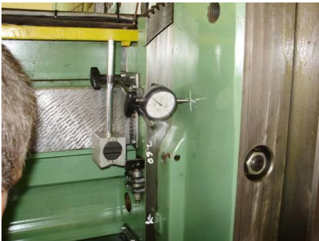
Figure 50: The RAM has a pivot point and the center of exactly 260 mm as long as the rotating surface, do the clock. Always remember that we turn radius and measure diameter, ie the error is 260 mm non-0.15mm, ie adjust only 0.075 mm. And is adjusted. The RAM has for this adjustment above a rotating screw.