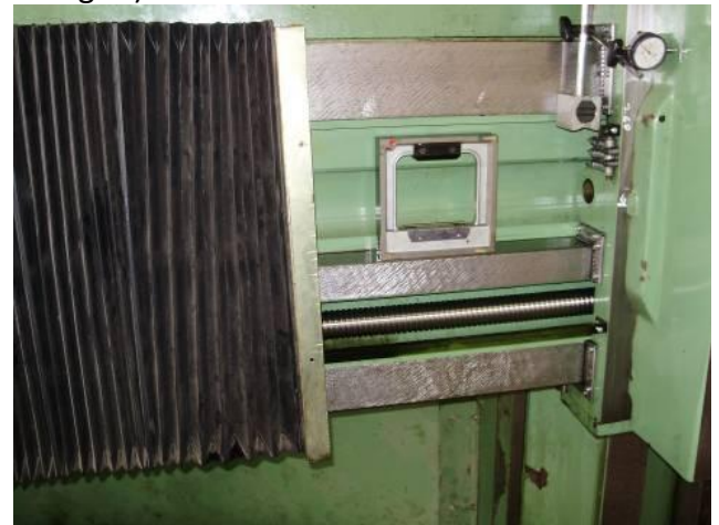
Figure 47: The transom is also checked. If that's not good, it can be set up on the shaft. But since you have to first make a plan rotation.