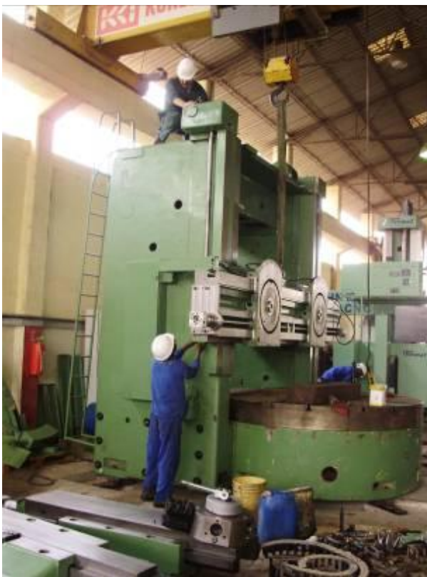
Figure 16: The transom is now above. He needs to be adjusted with a spirit level.