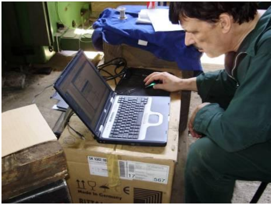
Figure 26: programming on the machine. Difficult conditions: temperature above 30 degrees, now and then a sandstorm passing through the hall, because it is open on both sides, ie without doors. The lap top is always very dirty. Then the sun, impairing visibility often hindered.