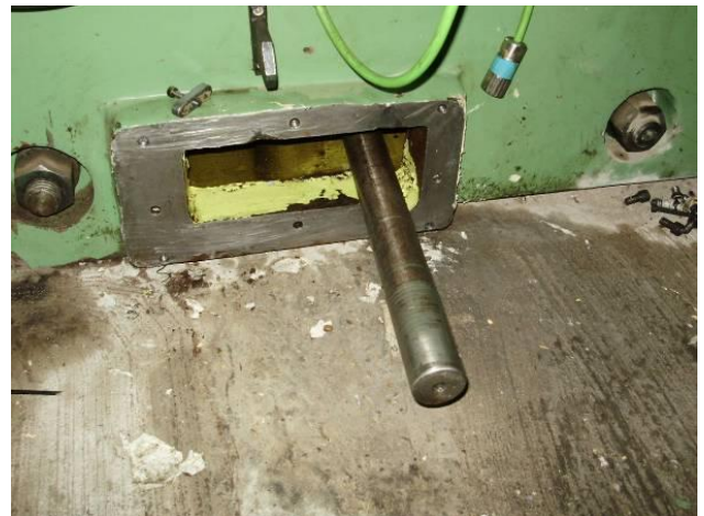
Figure 35: This wave was still about 4 mm long. So we shorten the shaft by a few mm so that the cover also has sealed properly.