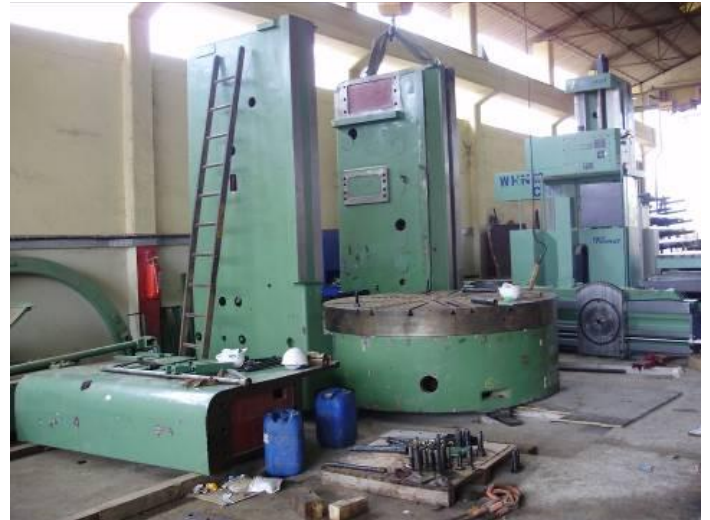
Figure 7: Now the second side stand is mounted.

stand is 3.8 meters high, minus the bar, which one needs to set up.