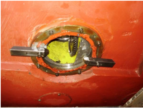
Figure 31: As under the machine a side wave came in, which measures the speed via the bevel gear in the image.