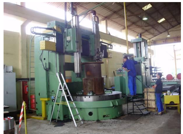
Figure 58: A very good, robust, heavy machine, which came with Bulgarian origin from the old Soviet era was converted from Conventional to CNC.

This reconstruction showed that conventional machine to CNC can be upgraded. The cost ceiling moves usually in one-third of a new machine.