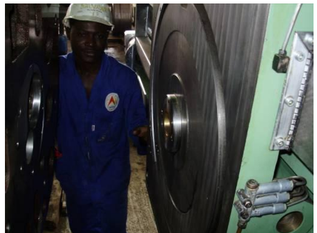
Figure 19: Here threading. With the long screws on it, that was only when we anpeilten first without screws, just the middle with the crane.