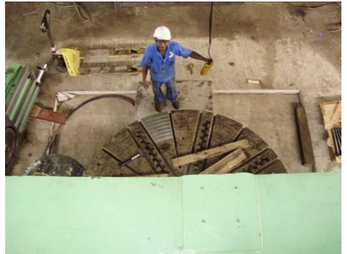
Figure 12: As small as the man's down there, so the machine is very high!