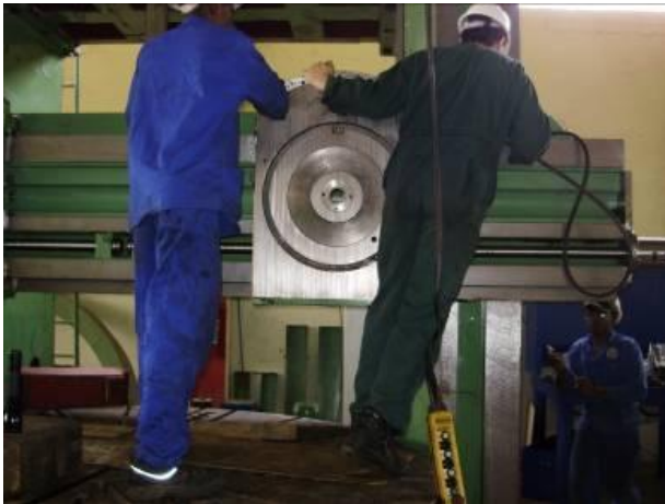
Figure 15: The threading of the various assemblies.