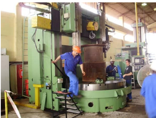
56: Okay, now the first rotation test can be started.

The cost of a retrofit (conversion with override)