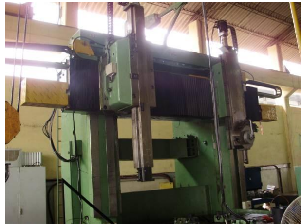
Figure 52: Now is then driven down a maximum maximum up to the cross beam to control the end positions switch.