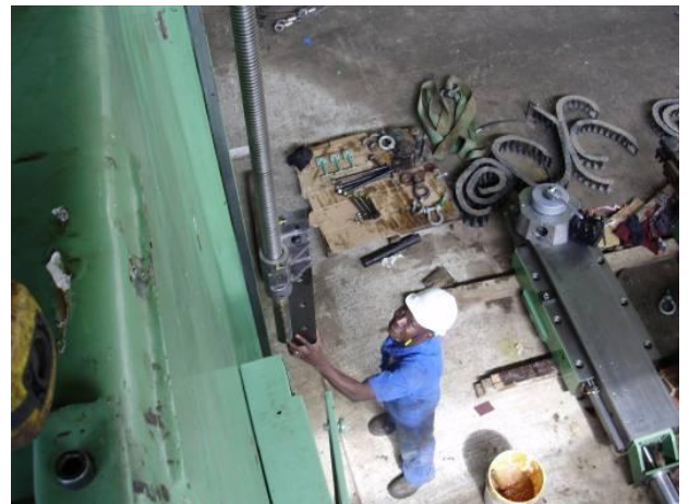
Figure 13: When mounting fear of heights is not suitable ..