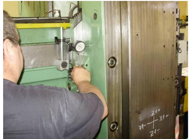
Figure 51: After adjusting the screws 4 are front retightened on RAM.