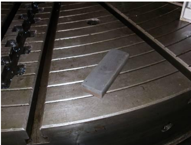
Figure 44: With the oil honing the table is deducted. Important to always deal with great care with the table and guides.