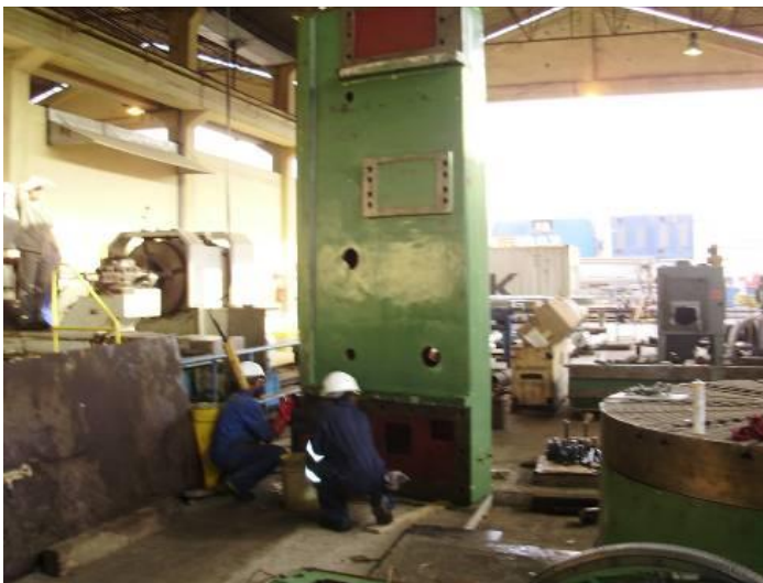
Figure 6: He is, but it was a lot of work, because the crane hook is only 4.8 meters and the side