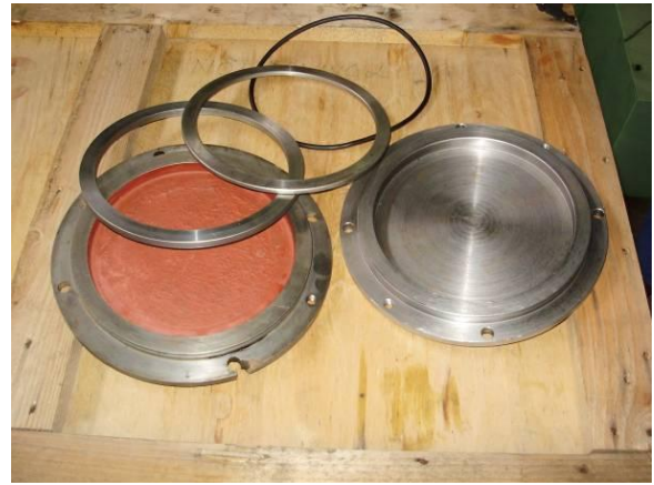
Figure 34: The cast iron lid down was broken. Then two spacers were fitted and these were 2mm too thick, meaning it pressed with full force against the bevel gear. We made a new cover and a spacer ring 2 mm thinner, so it had little game. The O ring in the lid was not fitted. So explained that the oil ran out.