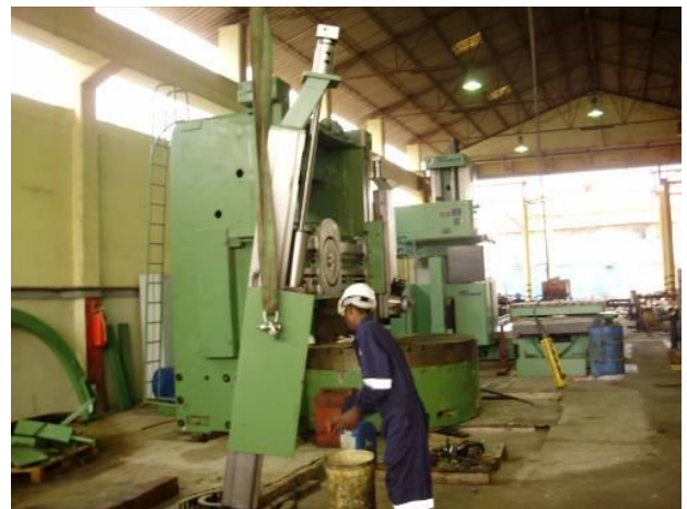
Figure 18: The last serious part of the machine is mounted today. It was expensive to have the long member just in the crane hanging.