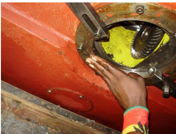
Figure 33: The bevel gear is pressed with spacer rings up so it was backlash.