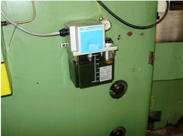
Figure 38: The cultivation of an automatic lubrication. The lubrication pump we have once again renewed with pressure switches and level switches, so that pressure line faults are detected at the control.