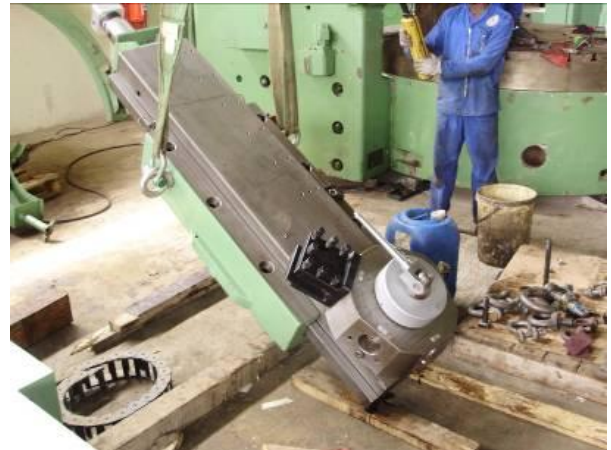
Figure 17: The carriage assembly. Despite Sunday when around 16 o'clock the work is finished. Here are 7 days / week, demanded.