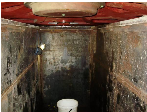
Blld 32: The bay under the machine.