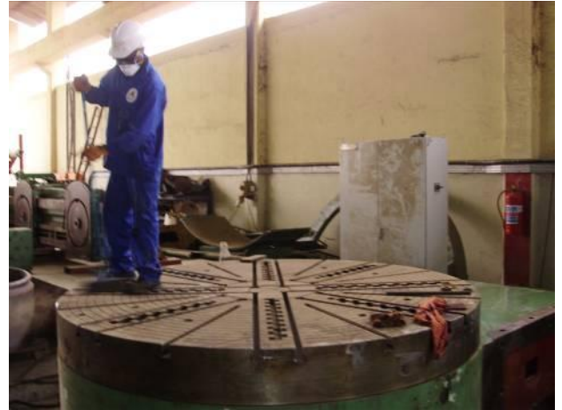
Image: 2 Search First, what was so from under the dust. By the anti-rust "Tektil" almost everything looks so, as if it were rusty.