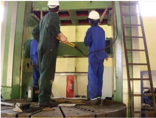
Figure 10: Here keep two men meet with two woods, so that the roof does not swing. Finger near are at risk.

exclude tilting. The roof is connected with 18 pieces. M36 screws.