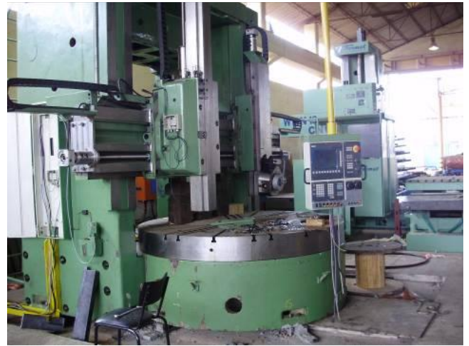
Figure 24: Installation of the panels and the gallows.