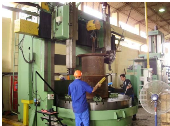
Figure 42: Now a large workpiece is placed on the face plate.