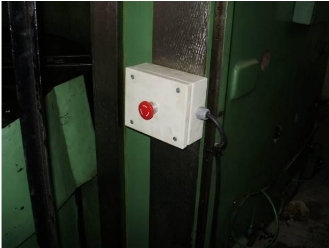
Figure 37: Emergency Stop buttons attached yet, so that when a man is in the machine, he can press the emergency stop.