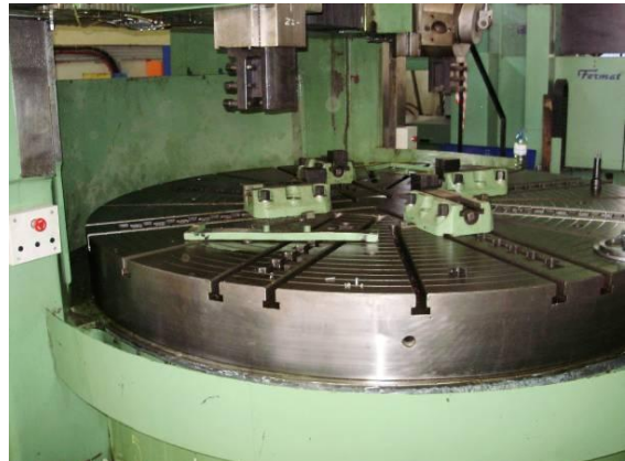
Figure 41: The two emergency stop buttons on the crossbar. we hope they will never need.