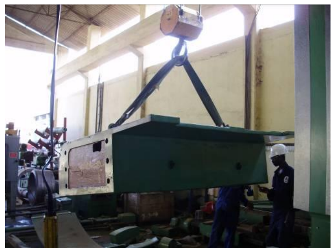
Figure 9: The roof and the interconnection with the intermediate plate, so that a good retraction