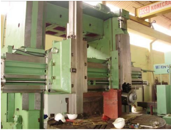
20: So the machine looked after 6 days. Much body work and climb and knowledge of crane handling. And secure assemblies, etc.