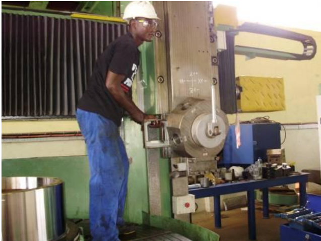
Figure 49: checking whether the RAM is in the water.

Figure 48: If it is possible to take a good reference surface to check with the spirit level the straightness.