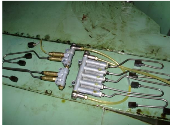
Figure 40: New and old grease mixed components.