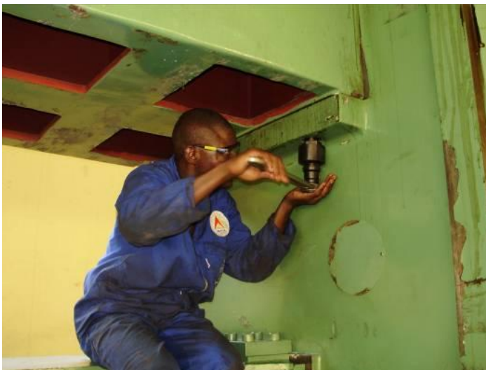
Figure 11: reindrehen With the 55 mm socket and ratchet the screw's one, but still re-cut threads in the roof is then exhausting.