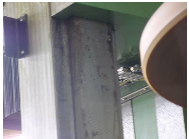
Figure 53: The plunger was long. Among the guides rust. This has then been involved, since it had no oil!