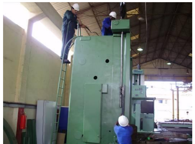
Figure 14: The Machine Head is mounted. A good thing, because after all, motors and spindles are driven up there. It's all instinct work and think ahead a lot is needed. Many screws were missing, still had to be organized.