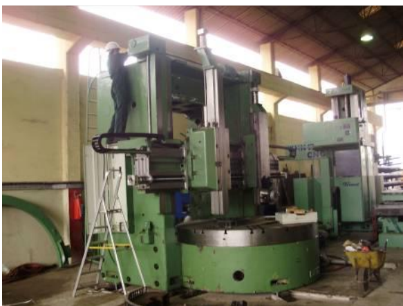
Figure 22: Previously a conventional vertical lathe and now new a CNC-controlled machine.