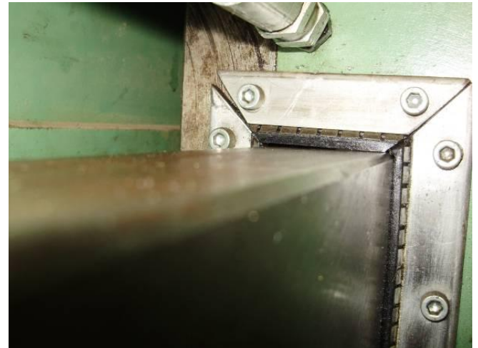
Figure 28: In the follow-up inspection such scrapers found. This press is insufficient to take the lead and so dirt can by under the wiper.