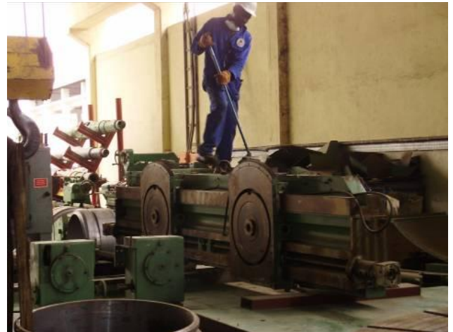
Figure 3: The cross bar was also completely protected against rust. Thus, the machine is transported from Denmark to Angola Luanda in a container which could be opened from above.