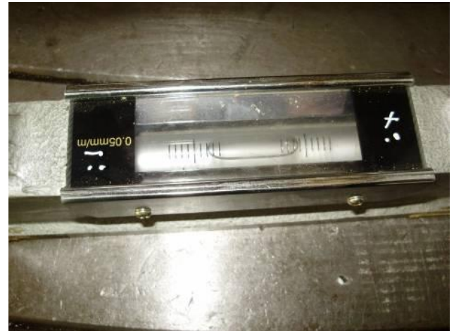
Figure 46: Consideration will be given to the frame-bubble level, as the faceplate is. We assume, as a rule, always a level with the accuracy of 0.05 mm per meter (0:02 is better, but is also very sensitive. Reacts instantly to sunlight.)