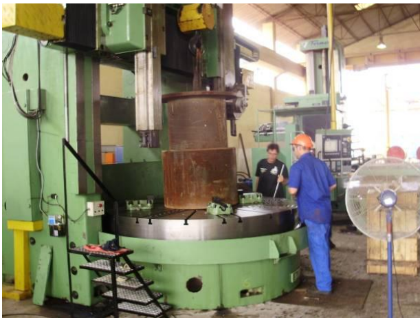
Figure 55: Good approximately align with the four claws robust box.