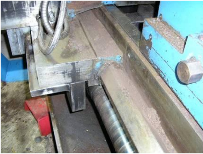
Figure 9: Here Carlo Wired still new after saw the terminals suffered from water.

Diplomatic revolver 4 compartment, defective, no longer swings.