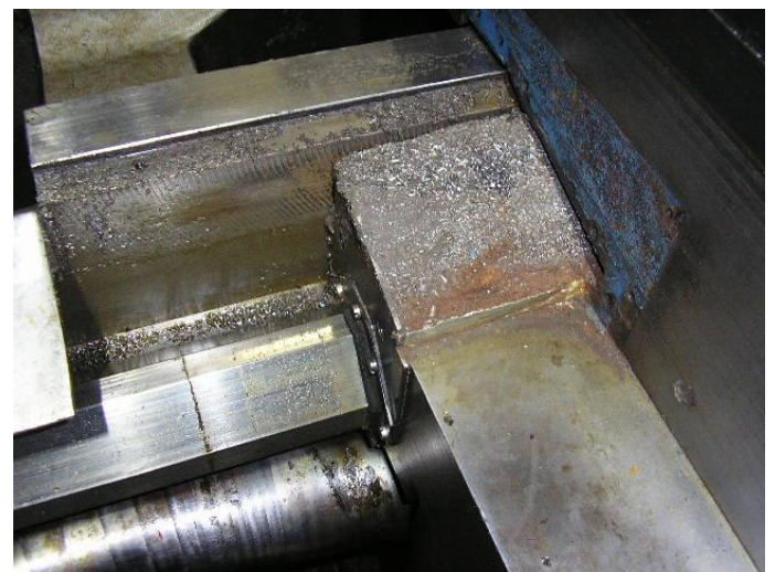
Figure 3: dirt. WU_270_30