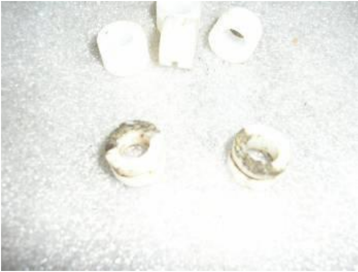
Figure 18: Parts that we ourselves manufactured. Subdivision after pattern.