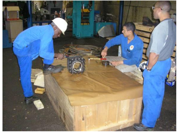
Figure 20: The assembly 01.