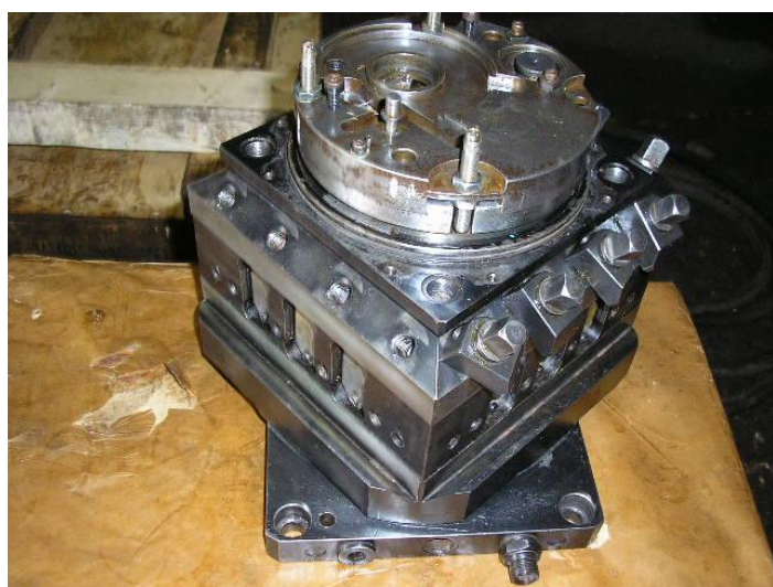
Figure 25: Soon ready-mounted turret, tested everything by hand, it locks beautiful. Tip top.

The WIAP AG continues to expand its machine tools and has a subcontractor base. Whether for new machines or conversions; there are usually used everywhere the same internal components. Thus, the spare parts warranty is secured.