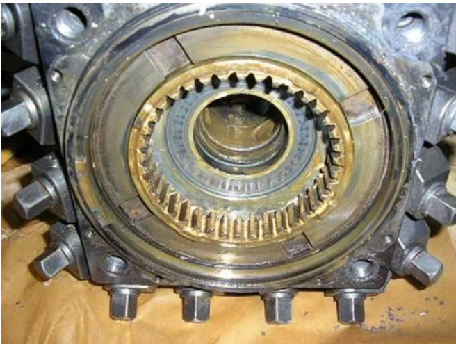
Figure 14: inside of a tool turret.