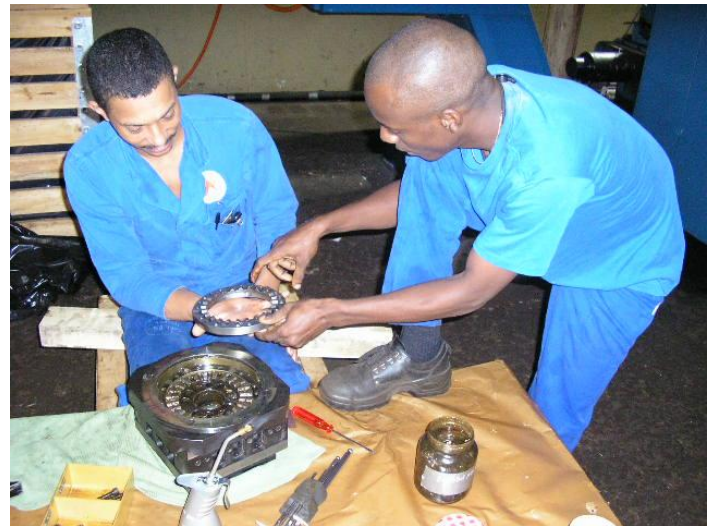
Figure 21: The assembly 02.