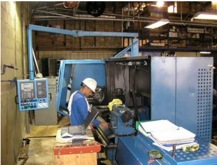
Figure 1: Project described. This machine came with an already existing Sinumerik 802C. In Angola, a Sinumerik was grown 802 DSL for special threads. In the cultivation work many shortcomings from Switzerland to light which have been fixed and was exploited simultaneously for training of maintenance came.