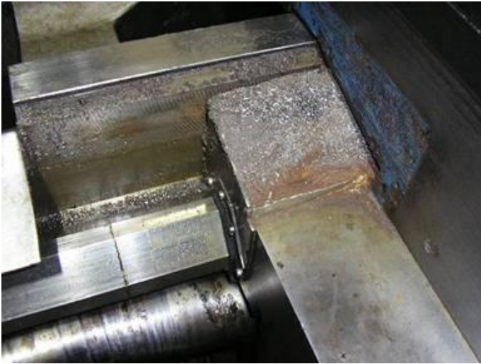
Figure 4: dirt.