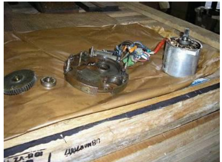
Figure 12: Disassembly of the turret provides some food-tasks.