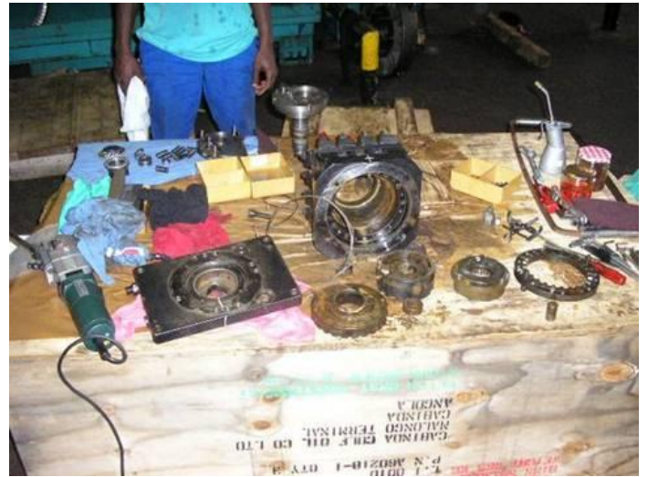
Figure 16: The is determined damage. It had spare parts to be procured.