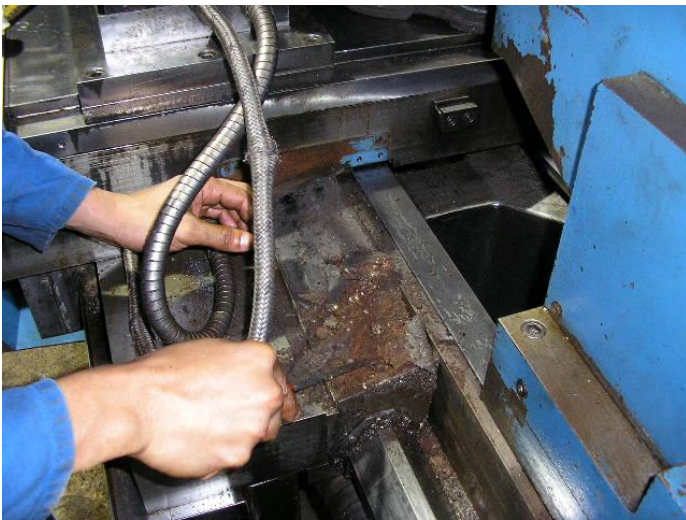
Figure 5: Age-cast, hard as concrete, under the sheets.