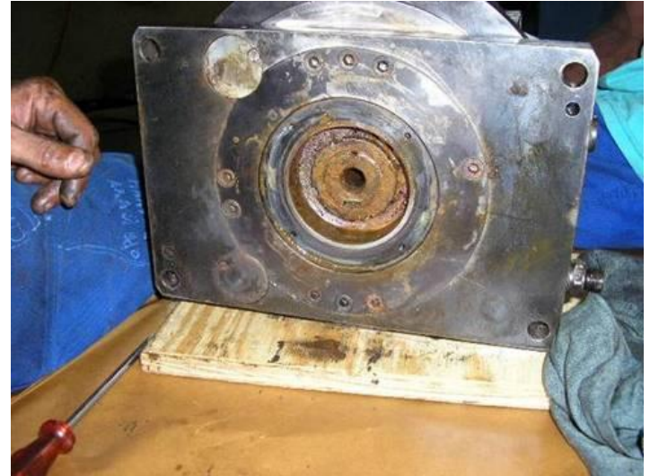
Figure 11: When the tank turret, the first grate Ahead redundancies.