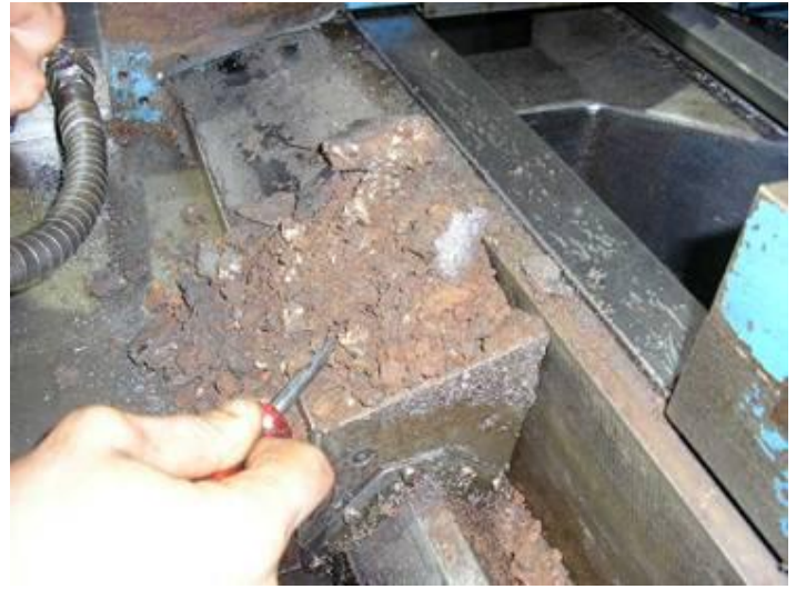
Figure 7: A lot of dirt, old dirt.