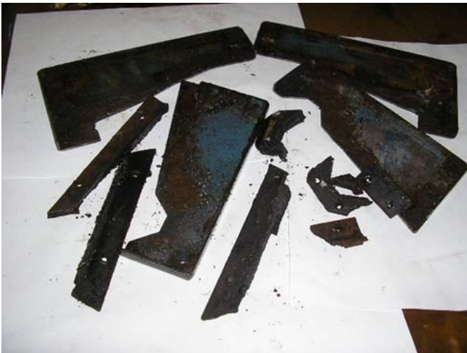
Figure 10: Terminal, one of many, was completely destroyed.