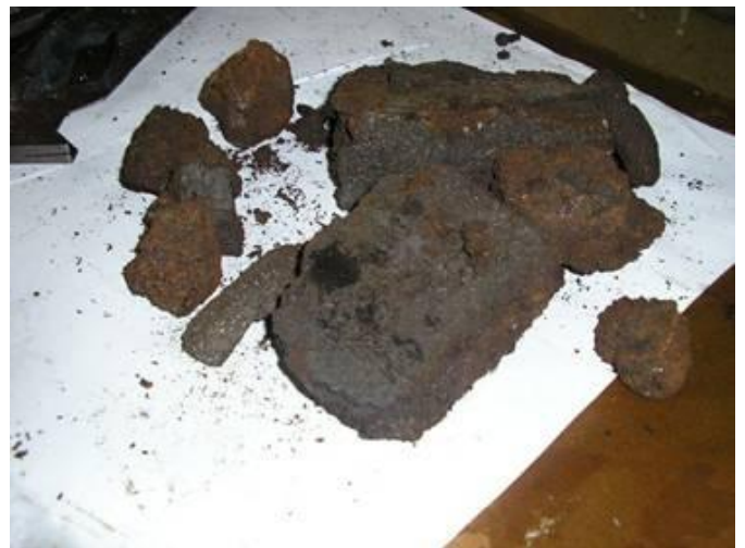
Figure 8: strippers, which must be replaced.