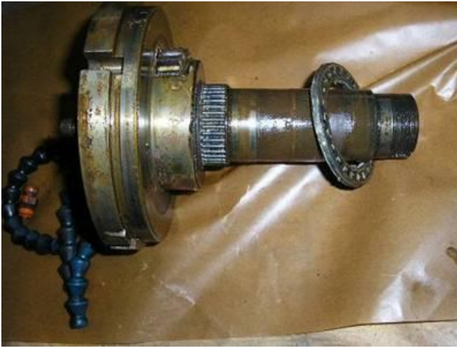
Figure 13: The inner part of the turret was completely rusted.