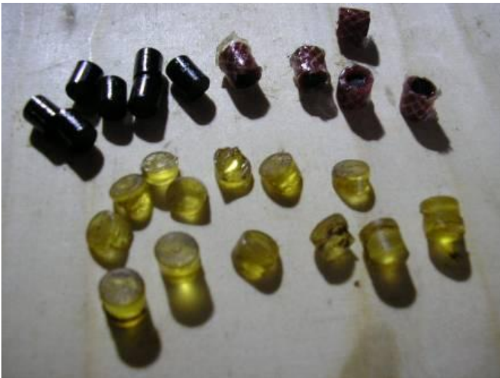
Figure 19: Front defective parts. With O ring and a water hose we could find the dimensions and find their own replacement product for these dampers.