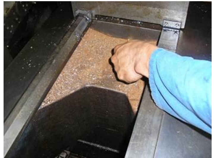
Figure 2: Then you find the rust in all caps, almost like in Angola! So you decide to unscrew many sheets.