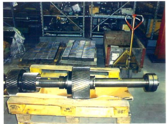
Image 23a from the feed gear shaft