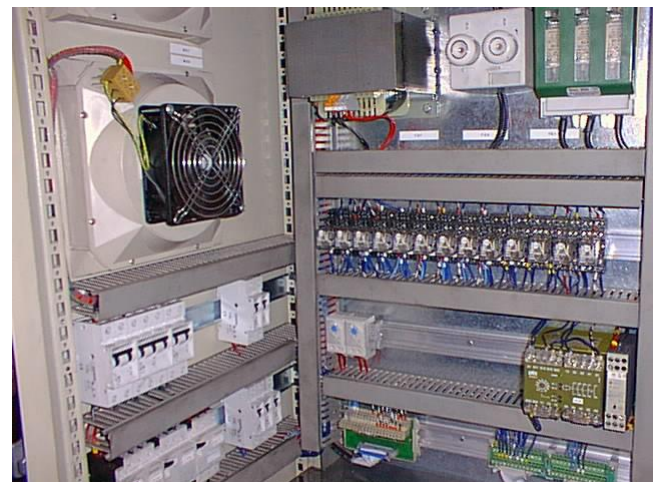
Figure 32: pavers electrical cabinet for the revised converted MFD roll lathe WDK 850 220 Spindeltrieb.