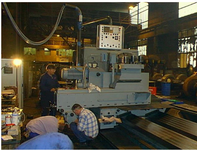
Figure 34: Ready-to-end user machine at