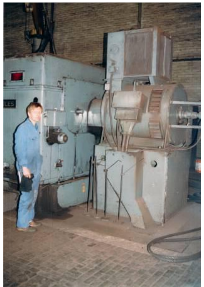
Figure 6: The headstock is almost as big as a child's bedroom. The 220 kW engine very strong.