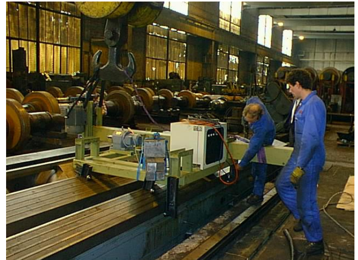
Figure 12a: As a portable milling device is processed here. For reference, the front, not worn sled is taken leadership. It was re-milled heavily worn tailstock guide which went several mm from the center. disassemble the machine with 150 tons and be edited externally, would have been complex and expensive.

headstock of a WIAP DM2A and the feed drive was made via a chain drive. The milling arm, prepared according to the method WIAP VDSF, reducing vibrations.