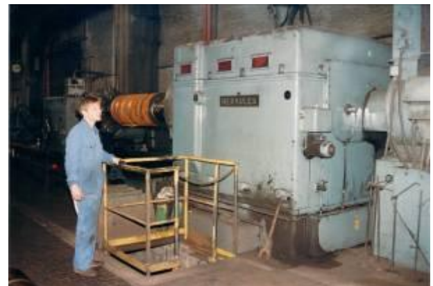
Figure 2: The machine has a spindle drive with 220 KW. The whole electrical system was renewed by us incl. The spindle drive.