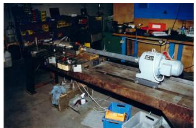
Figure 19: The leaked spindle was honed with a WIAP Hohn device.