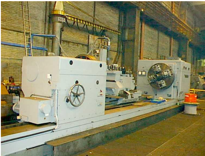
Figure 1: After the conversion of the WDK 850 MFD roll lathe, by WIAP AG.

Task: The roll lathe must get control no new CNC. However, it should be totally revised. The operators were accustomed to copy itself, so no CNC. The transmission had a damage. The tailstock guidance was lowered by several mm and had to be re eingeschabt. totally revise the cross slide, all with a new sliding layer.