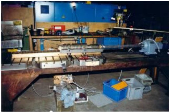
Figure 20: until the spindle again had the same measure, so that the spindle could be set backlash between the central zone and the outer zone two days had to be honed. The game was virtually gone.