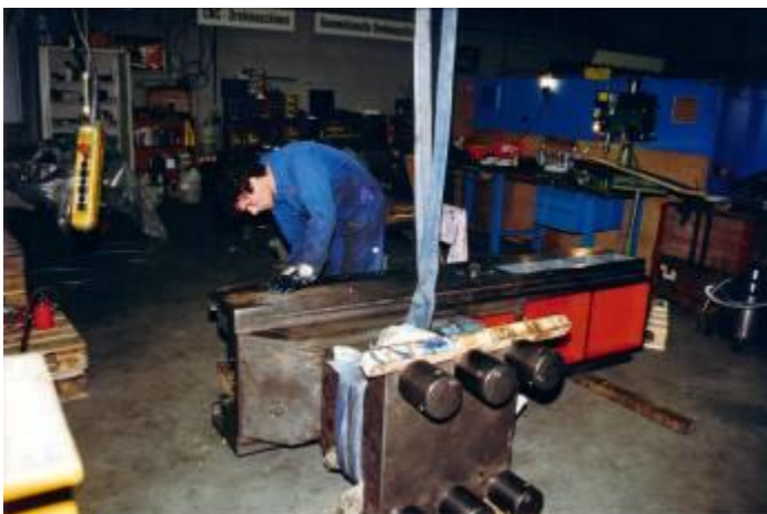
Figure 16: The sword holder of the roller turning machine is a very robust construction. He, too, had to be completely overhauled since it has experienced through the years of production, very large wear. The carriage was continuously loaded with a thrust of 20 tons.