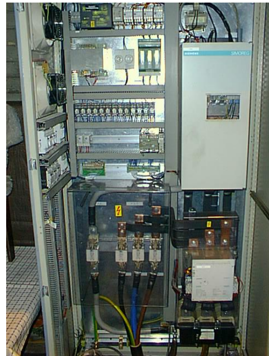
Figure 31: New electrical cabinet for the 220 KW Copying lathe