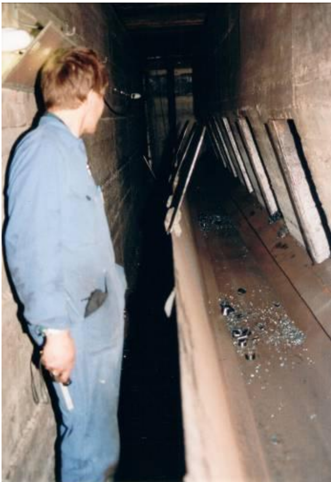
Figure 4: Under the machine is the chip tray. 220 KW and the large torque chips are so large as flat iron, removed here.