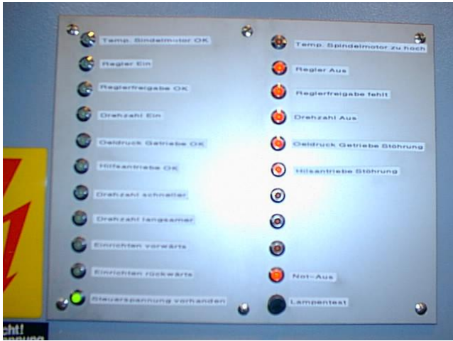
Figure 33: scoreboard for the status display.