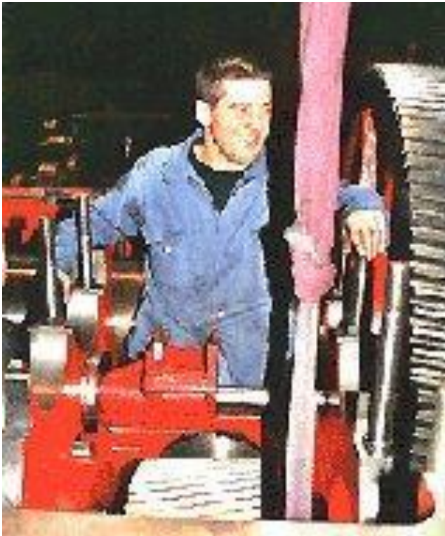
Figure 30: The size of the headstock is impressive. The whole reconstruction with the revision, lasted all in all, less than 6 months. After delivery no guarantee had to be made. The machine was run continuously after start-up, without interference. The planning and execution were so ok