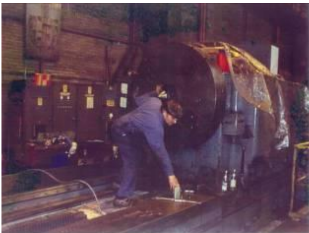
Figure 8: The dismantling of the Z-carriage, which went on the revision to us in Switzerland.