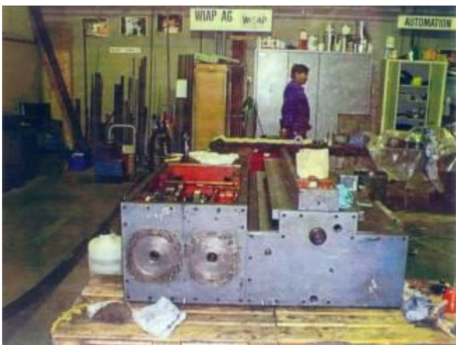
Figure 15: sled during the audit.