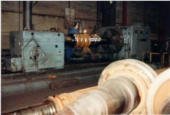
Figure 11: Here again the roll lathe before dismantling.