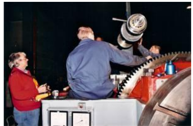
Figure 29: The installation worked very well. The transmission of the MFD, hats off, we can only praise the manufacturer. Sensational, like the whole structure was made accessible from above. Perfect, thanks to MFD, which is one of the best machines we've ever seen.