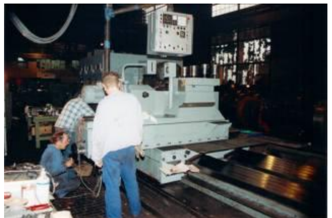
Figure 24: Finally, after two months, the slide could be relaunched again. The customer was very happy.