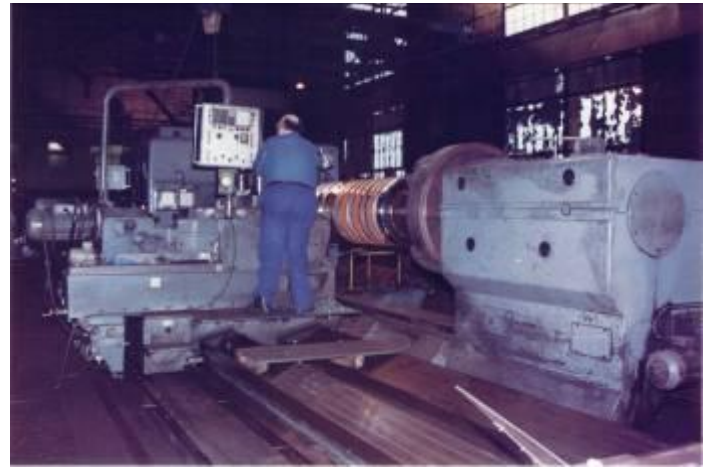
Figure 5: These professionals of skilled workers, which rotate these rollers are unlikely talents.