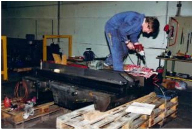
Figure 14: The carriage, who was about 20 tons, was brought to Switzerland for revision. Here, the decomposition of the carriage.