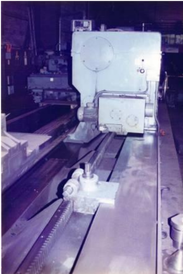
Figure 7: The guide to the tailstock had expired several mm.