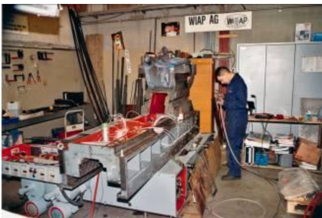
Figure 22: This, more than 20-ton sled was finally a revised sleigh with new SKC shows ect new eingeschatbten gears, lubrication system.