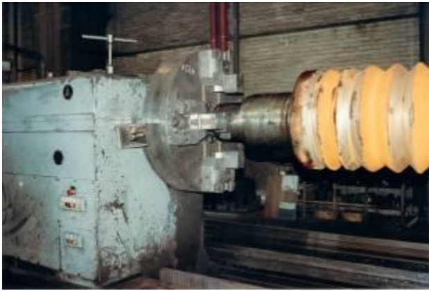
Figure 3: The claws box revised from scratch.