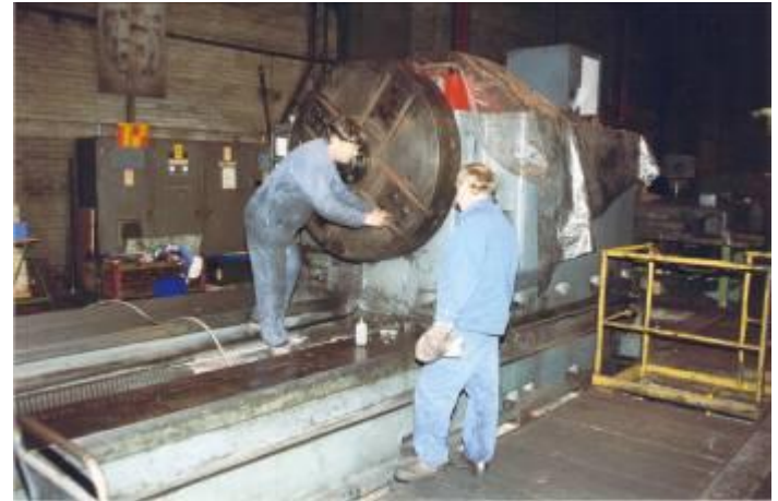
Figure 1a: Before the reconstruction of the 150 tons of machine Waldrich WDK 850 machine MFD. Before: The machine could only partially be delivered to Switzerland, for the revision. The breakdown of the 150 tons of machine was more expensive than to revise locally.