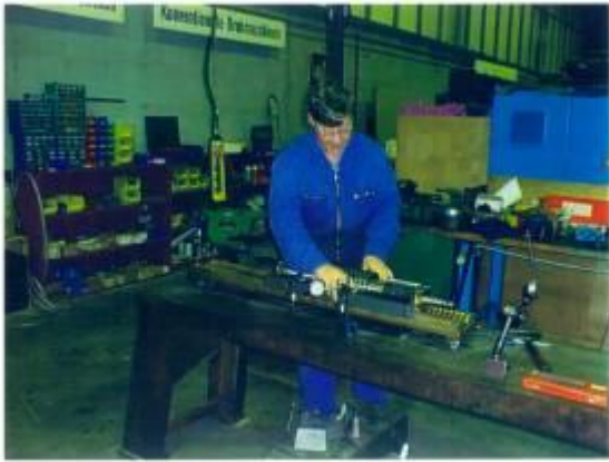
Figure 21: Thanks to good tact and patience, the result was excellent.