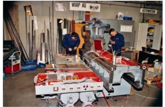
Figure 17: The carriage guide was re-occupied by SKC. The whole lubrication improved and renewed. The complete revision sled in Switzerland lasted 6 weeks.