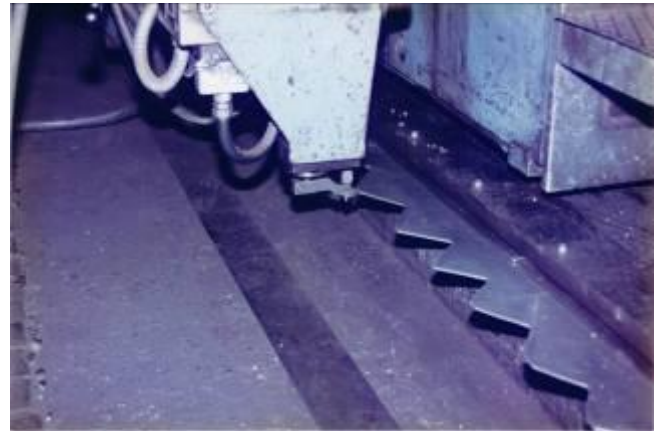
Figure 9: The machine is equipped with a copying device. The tracer by the company Heid. The electronics of tracer point from Siemens. This electronic device was no longer available. The WIAP AG had 4 new WIAP produce copy cards, according to the model Siemens. With new components, because the old ones were no longer to buy.