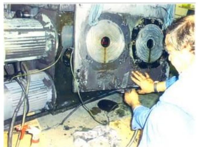
Figure 13: The whole cross slide of the roller turning machine was in a very bad condition.