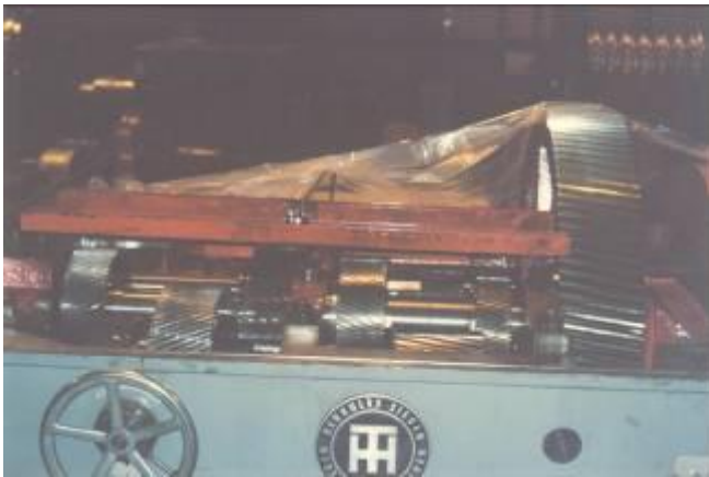
26: Because of the damage in the headstock was not pre-calculated, it was agreed only open the gear, then the prices.