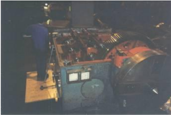
Figure 25: The transmission of the machine also had gear stages, which were no longer working. In addition, the spindle was not round.