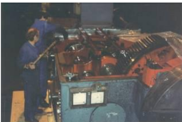
Figure 27: The separation was very expensive. Almost everything Press Associations where we needed the 2500 Bar Abpressvorrichtung. But it all went very well.