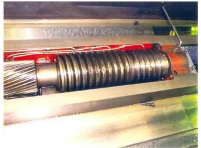
Figure 23: This longitudinal slide worm shaft expired in mm range. After the revision back in the 0.1 mm range backlash.