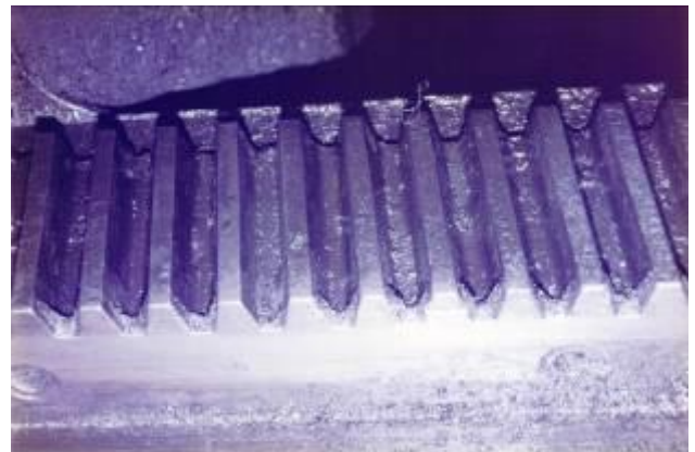
Figure 10: The rack of the Z axis was high above 150 mm. Erupted teeth; 3 racks had to be re-established after pattern.