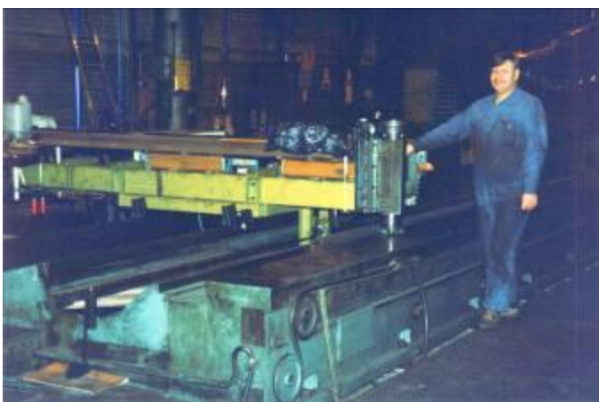
Figure 12: The leadership of the machine bed was at the customer site, milled by the reference to the Z axis. The milling device was fitted with a

headstock of a WIAP DM2A and the feed drive was made via a chain drive. The milling arm, prepared according to the method WIAP VDSF, reducing vibrations.