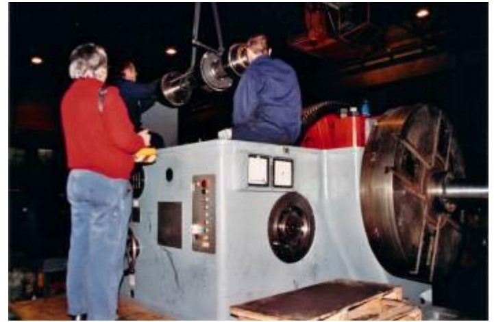
Figure 28: Finally, could be lifted out of the main transmission shaft. Then we were able to offer the defective gear. Thanks to a Swiss gear manufacturer, we quickly had everything organized. The customer ordered within 1 day. Two weeks later, we had the gear to pattern.