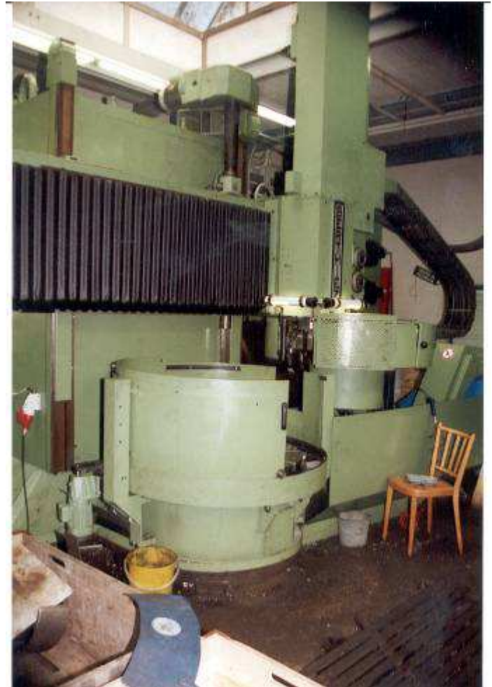
Figure 2: The machine is in good condition. Was acquired by a major Swiss company truck in a Swiss foundry. Heavy cutting was announced for this machine.