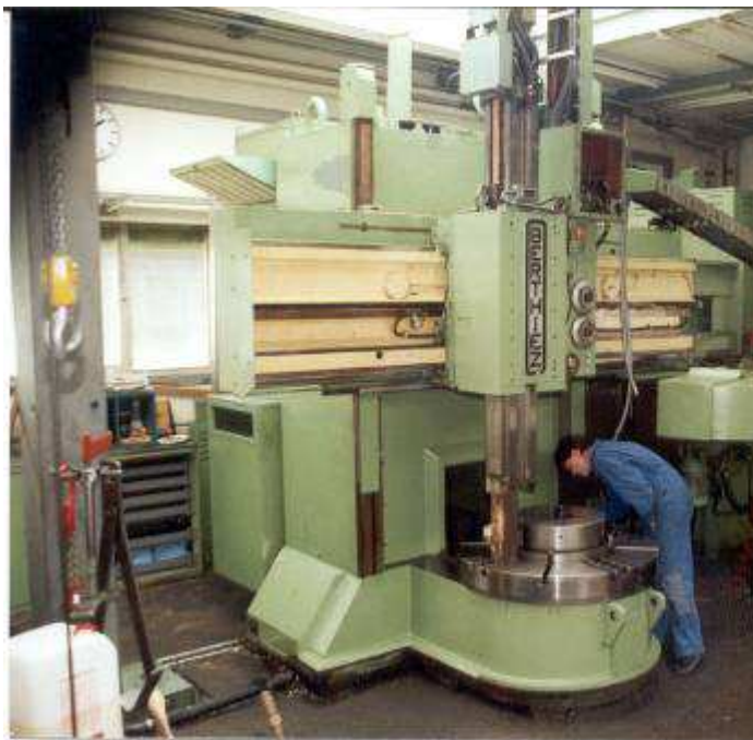
Figure 1: The Berthiez carousel, France, has been completely equipped with new feed motors, new spindle motor and a new CNC Sinumerik.