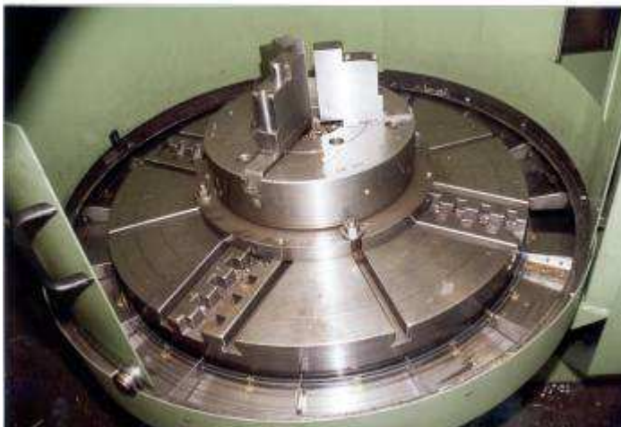
Figure 5: A ring system has the swarf which fall outside by the centrifugal force, is collected and moved through a hole in a chip conveyor.

The WIAP AG continues to expand its machine tools and has a subcontractor base. Whether for new machines or conversions; there are usually used everywhere the same internal components. Thus, the spare parts warranty is secured.