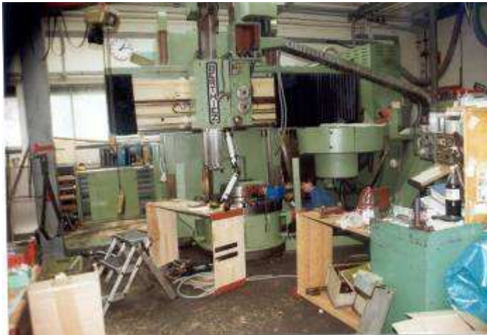
Figure 3: Conversion Berthiez VTL by WIAP AG.