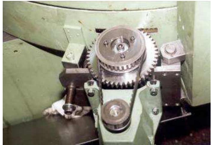
Figure 6: Drive of the chip collection ring.