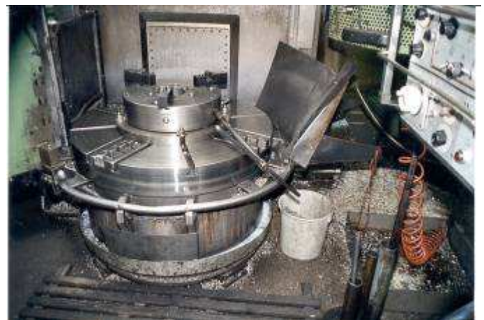
Figure 7: So the solution AG looked through the WIAP before mounting.